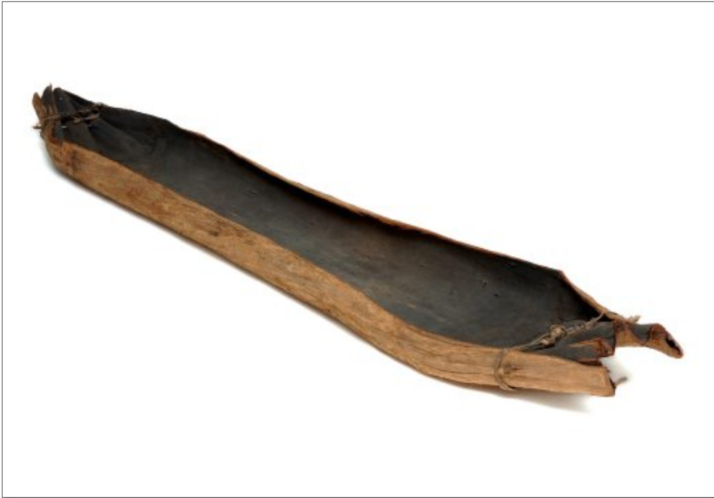
NSW Bark Canoe.