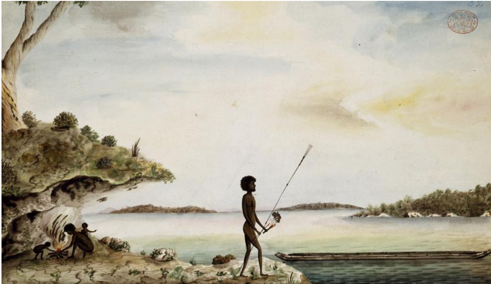
Native going to Fish with a torch and flambeaux, while his wife and children are cooking fish for their supper, by The Port Jackson Painter, 1788-95.