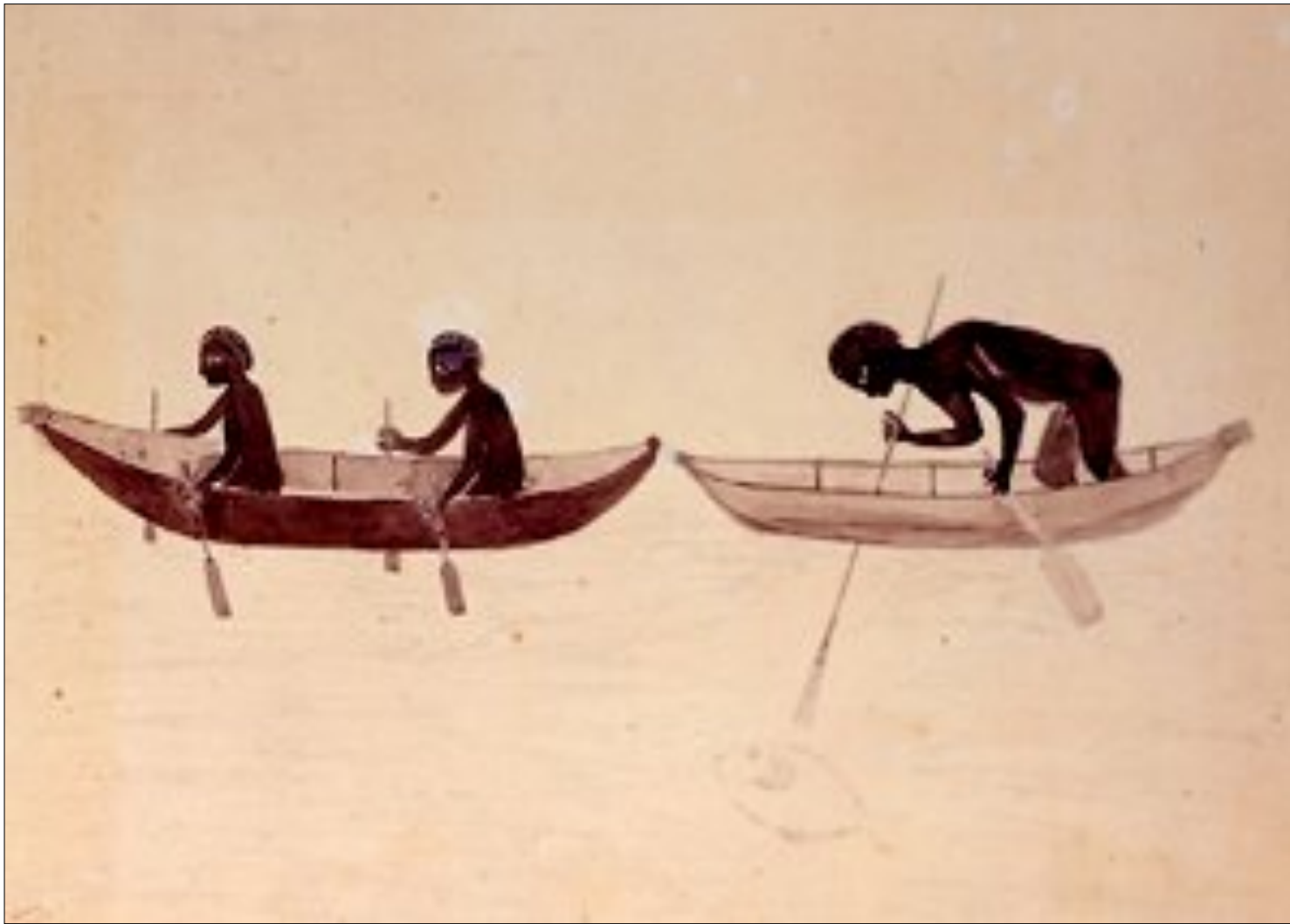
Bark Canoe, Botany Bay, 1770.